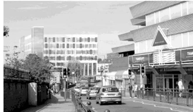
View from Clive Road

The Urban Gravesham Committee thinks that the loss of historic buildings is unnecessary and that the multi-storey car park is over-scaled and a huge mistake. If you agree, it is important that you write a letter of objection now to: