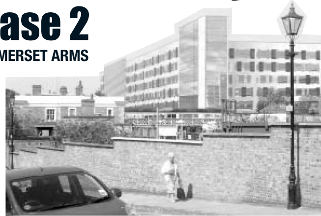
View from Rathmore Road

People will have noted all the work taking place round the Civic Centre. This is the first phase of Gravesend's Transport Quarter - the aim being to provide a traffic free 'Civic Square'.